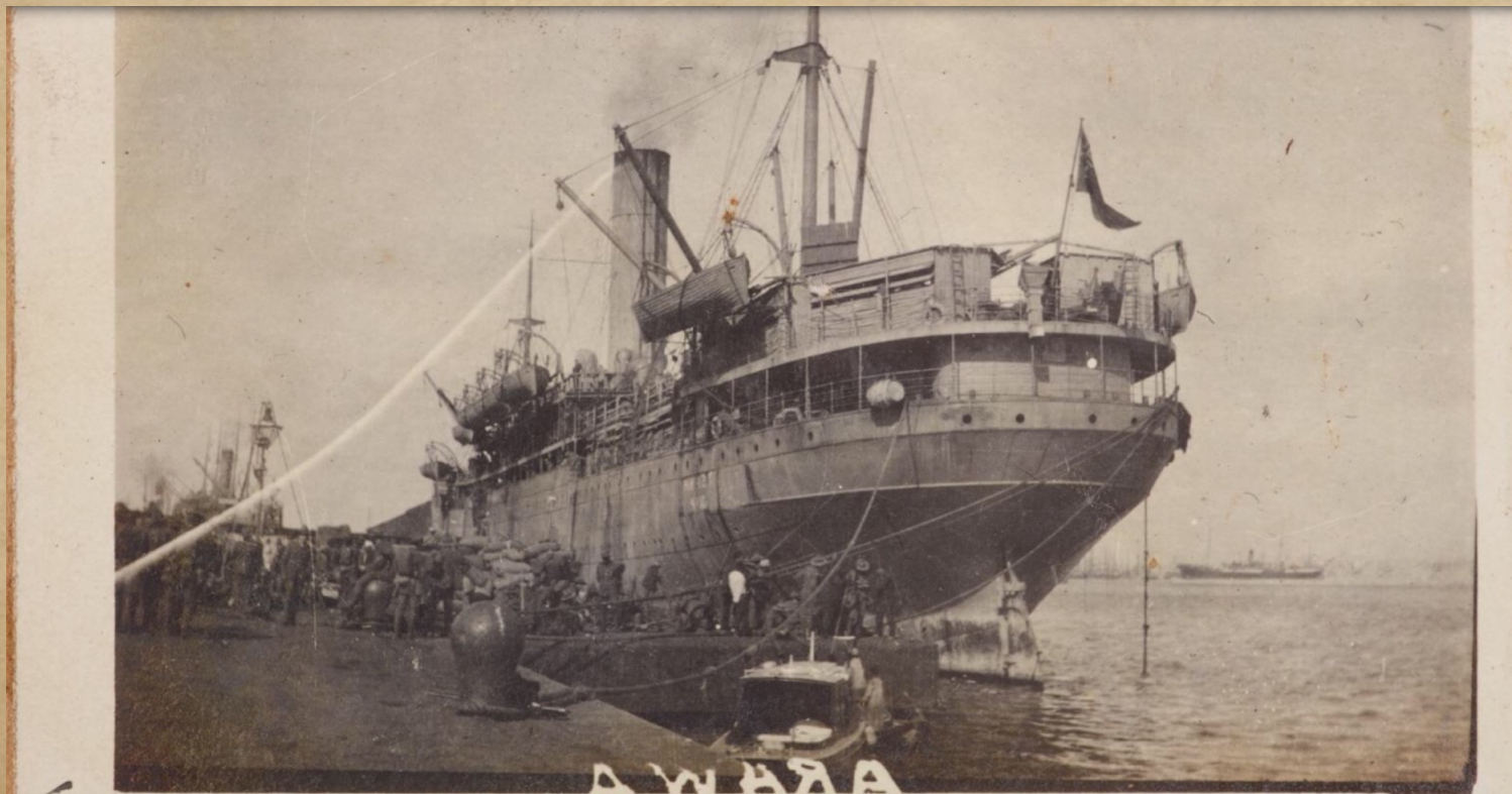
THE "ARAWA" AT WELLINGTON. NZ TROOPS EMBARKING 1914