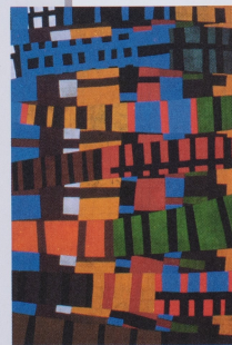
Nancy Crow, Construction #38, 2000