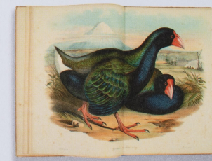
Hala (above) and takahe (right) from John Gould's Birds of Australia , published 1837-1848