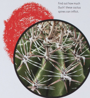
Find out how much Ouch! these cactus spines can inflict.

Admission charges apply. Adults $10, children $5, concessions $7.50, families $22.50. Discounted entry for members.