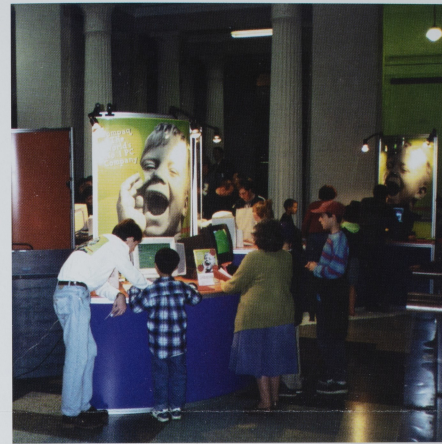
Visitors enjoy the Compaq Day of Discovery Open Day