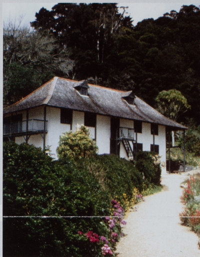
Pompallier House in Russell

New Zealand Historic Places Trust is inviting Auckland Museum Institute members in Russell over the summer to visit Pompallier, a working 'factory' of 1842 with a demonstration of tanning and printing of the period being undertaken. Show your membership card for the special entry rate of $2, between 29 December 1997 & 31 January 1998 (closed 1 January). Early planning has begun for Members' tours to MONZ in Wellington and to Sydney to visit some of the fine museums there. Those interested should register promptly so that final details may be decided.