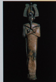
Statue of Osiris, Ruler of the Realm of the Dead

The Ancient Egyptians built a civilisation around a complex religion that worshipped over 50 gods, deified kings or pharaohs as living gods, and centred on a belief in an afterlife. It is this ancient belief that life continued after death that ensured the preservation in tombs of many of the objects now highly prized in museum collections around the world and which will feature in the Auckland exhibition.