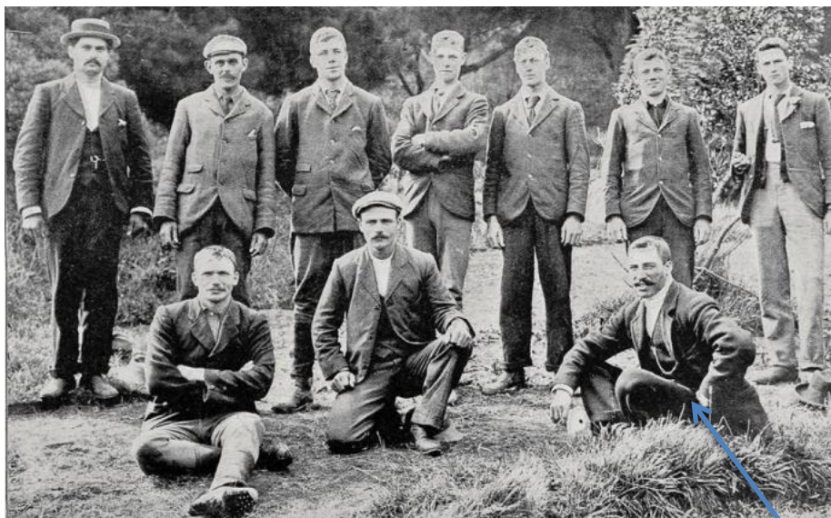
Gisborne's members of the 7 th Contingent