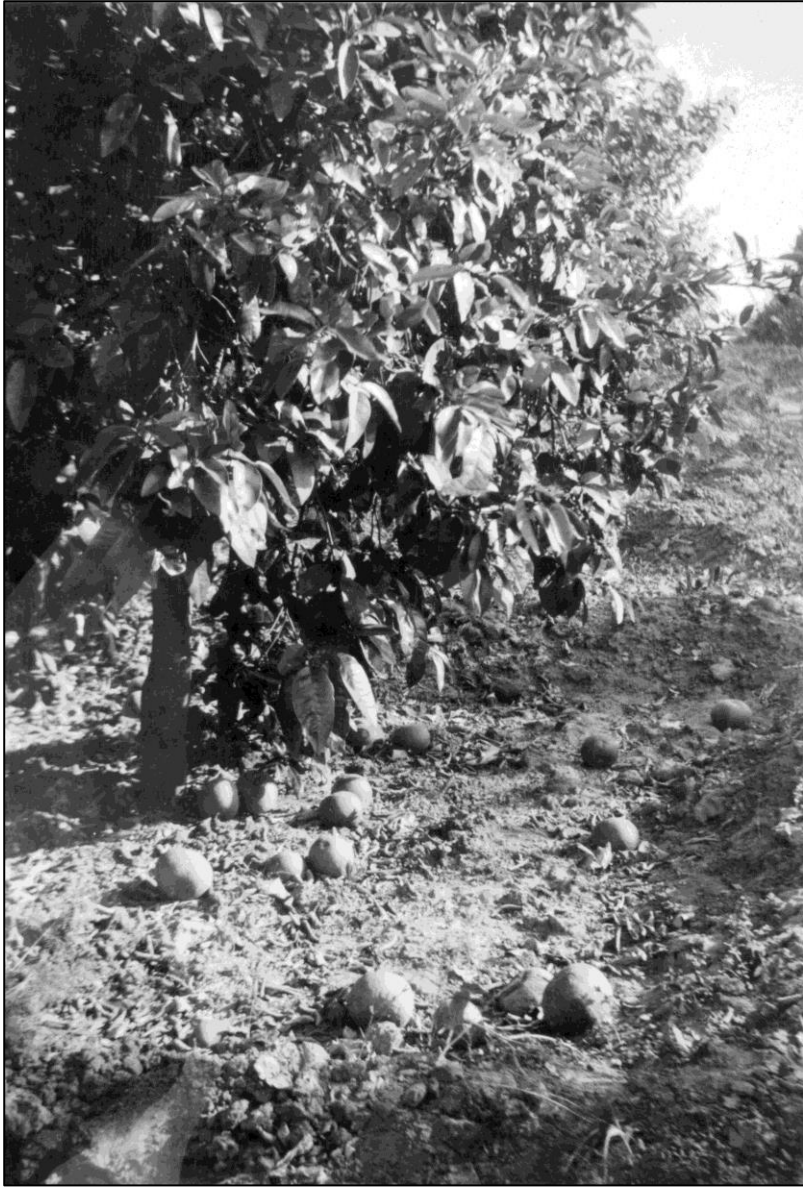
Orange tree. How would you like to pick up oranges like this.