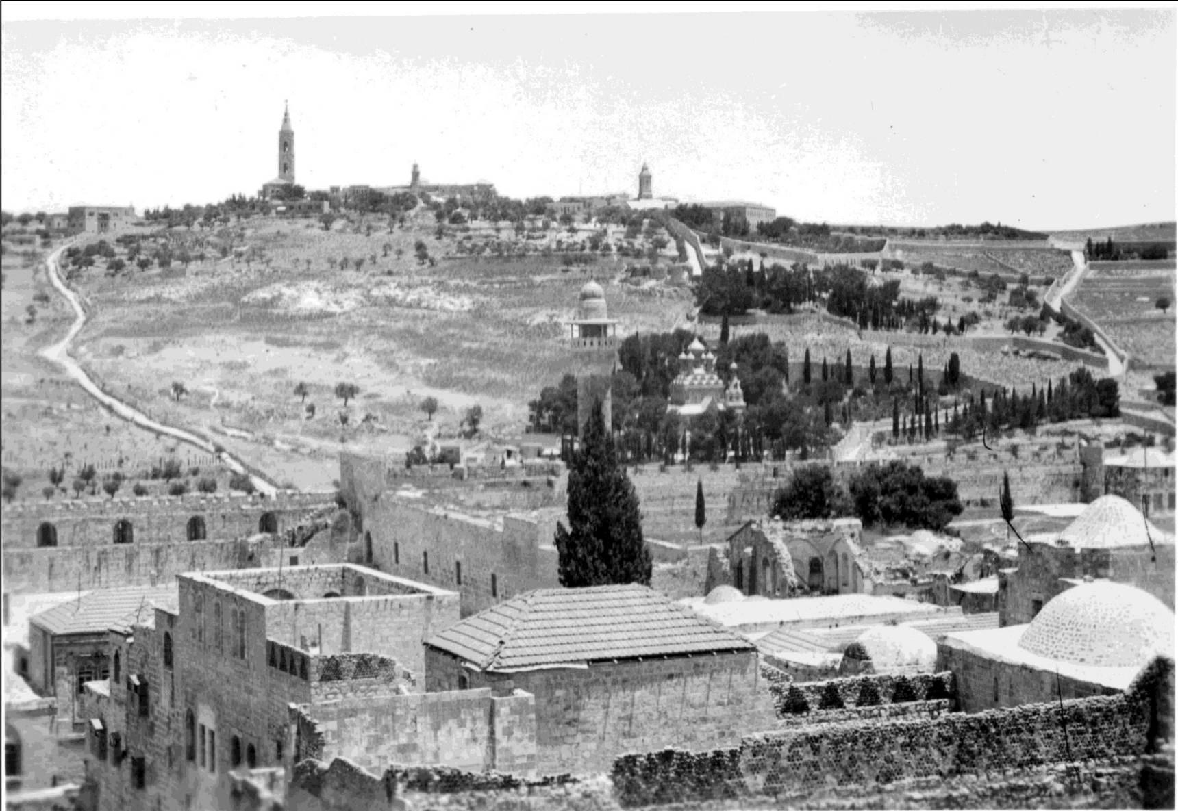
Mount of Olives