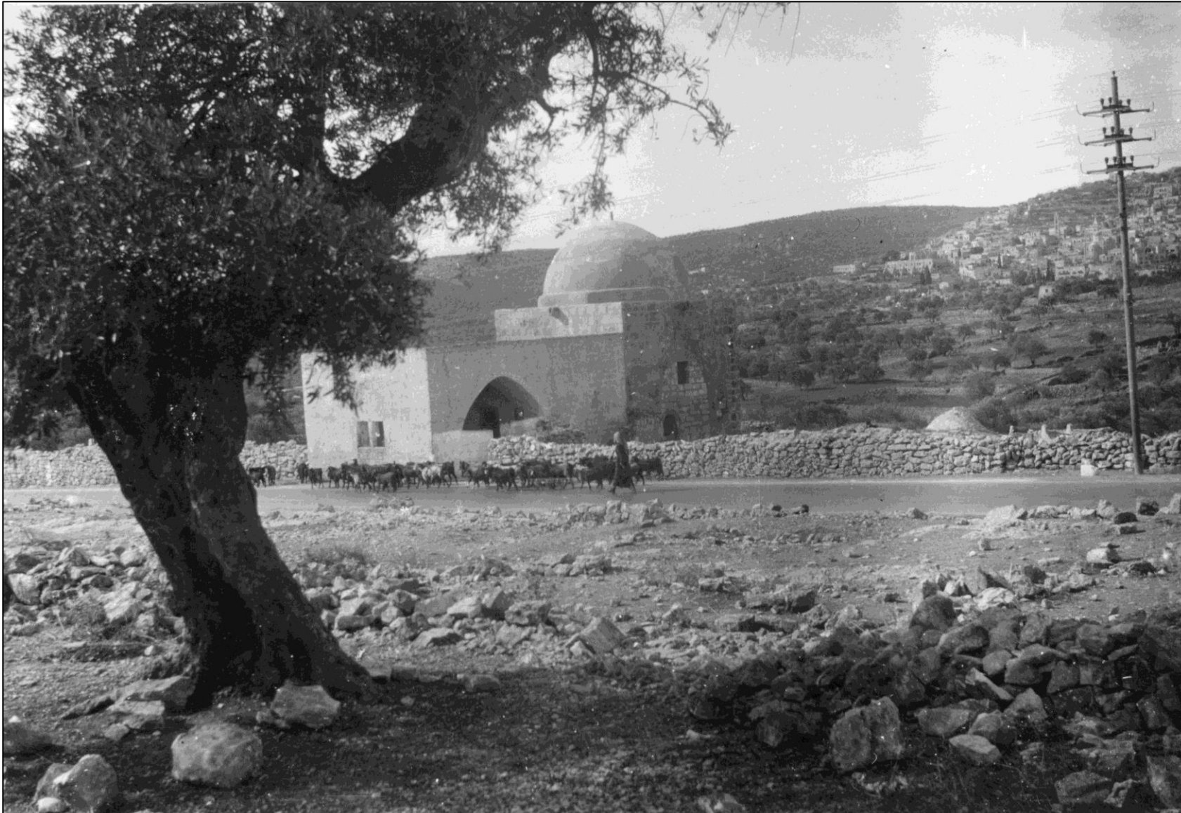
Rachel's Tomb. ( Rachel's Tomb is the site revered as the burial place of the Hebrew matriarch Rachel. The tomb, located at the northern entrance of Bethlehem, is considered holy to Jews, Christians, and Muslims.)