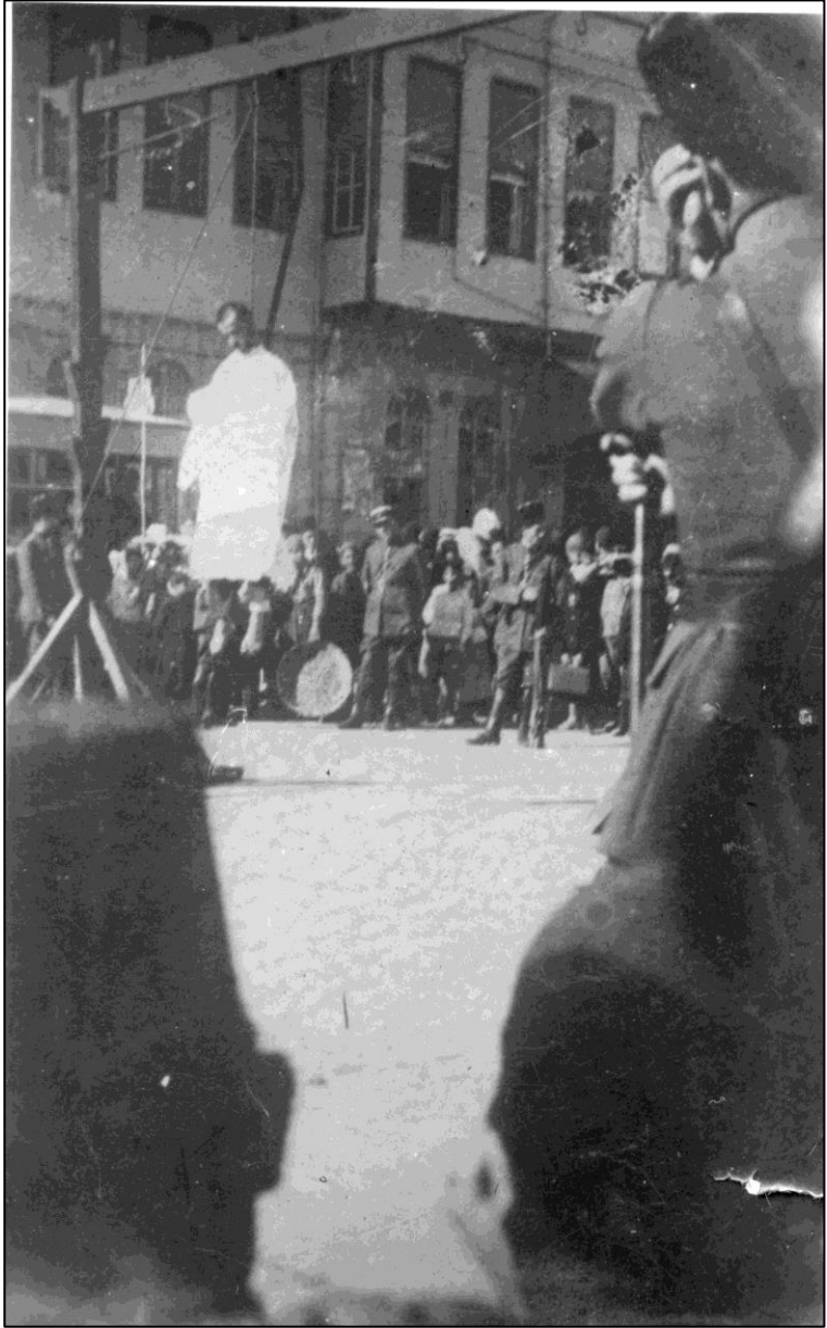
This is what happens to bad men in this country. All executions take place in the main towns in public places and the body left hanging. This was in Damascus.

This is what happens to bad men in this country. All executions take place in the main towns in public places & the body left hanging. This was in Damascus.