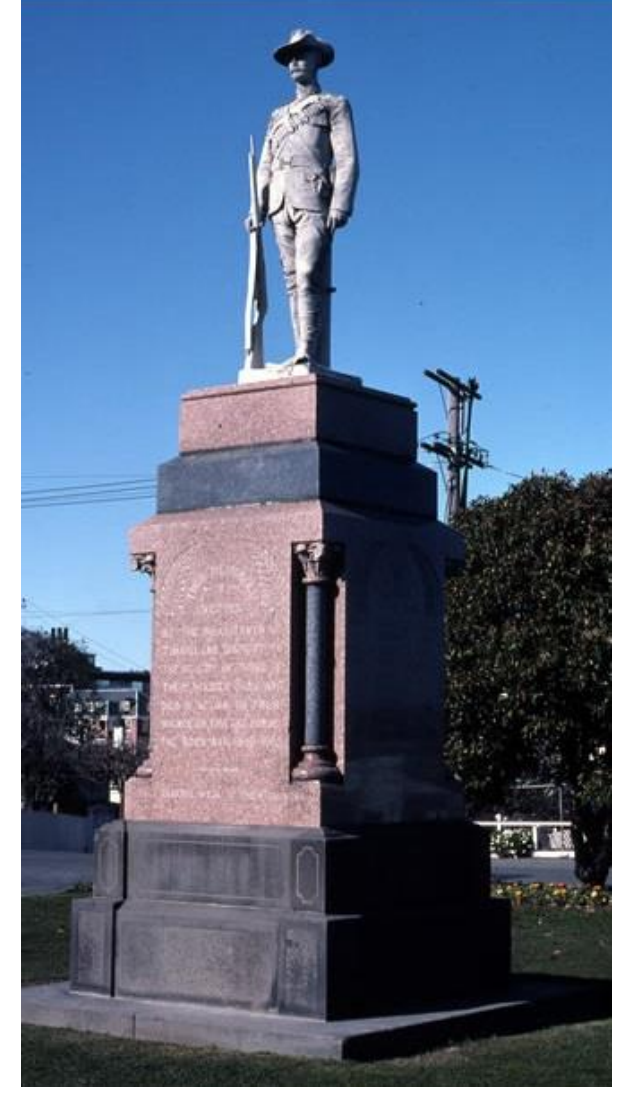
TIMARU SOUTH AFRICAN WAR MEMORIAL