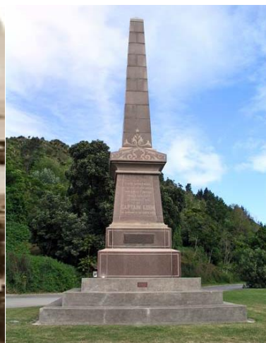
As it is today The Cook Memorial at its site on route to Kaiti Beach. The war veterans' plaque was removed