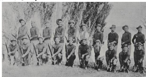
Gisborne's 4 th Contingent