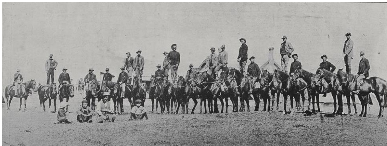
23 Mar 1900 - THE GISBORNE 4 TH CONTINGENT: