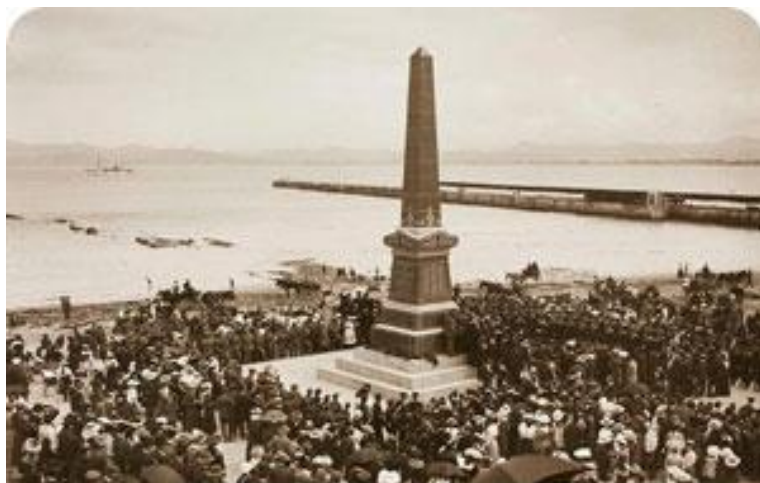
As it was in 1906 Captain Cook Memorial at Kaiti Beach with silver plaque of SA Boer War Soldiers