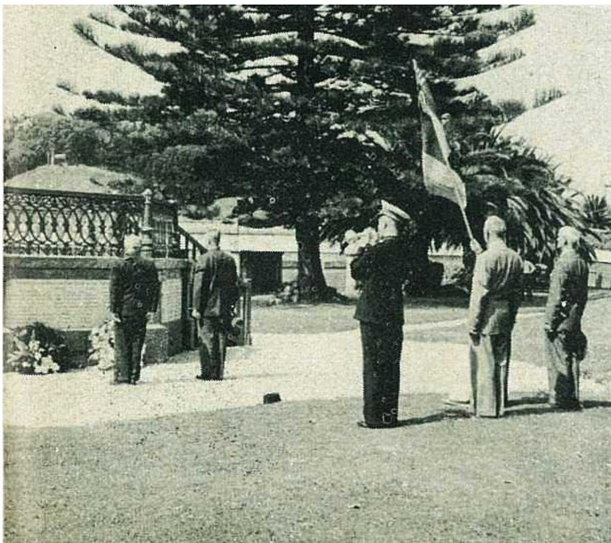
1957 - The ceremony is seen, as the Last Post was sounded.