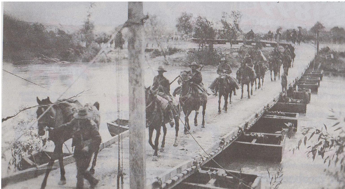
The Mounted Rifle Brigade crossing the Jordon River