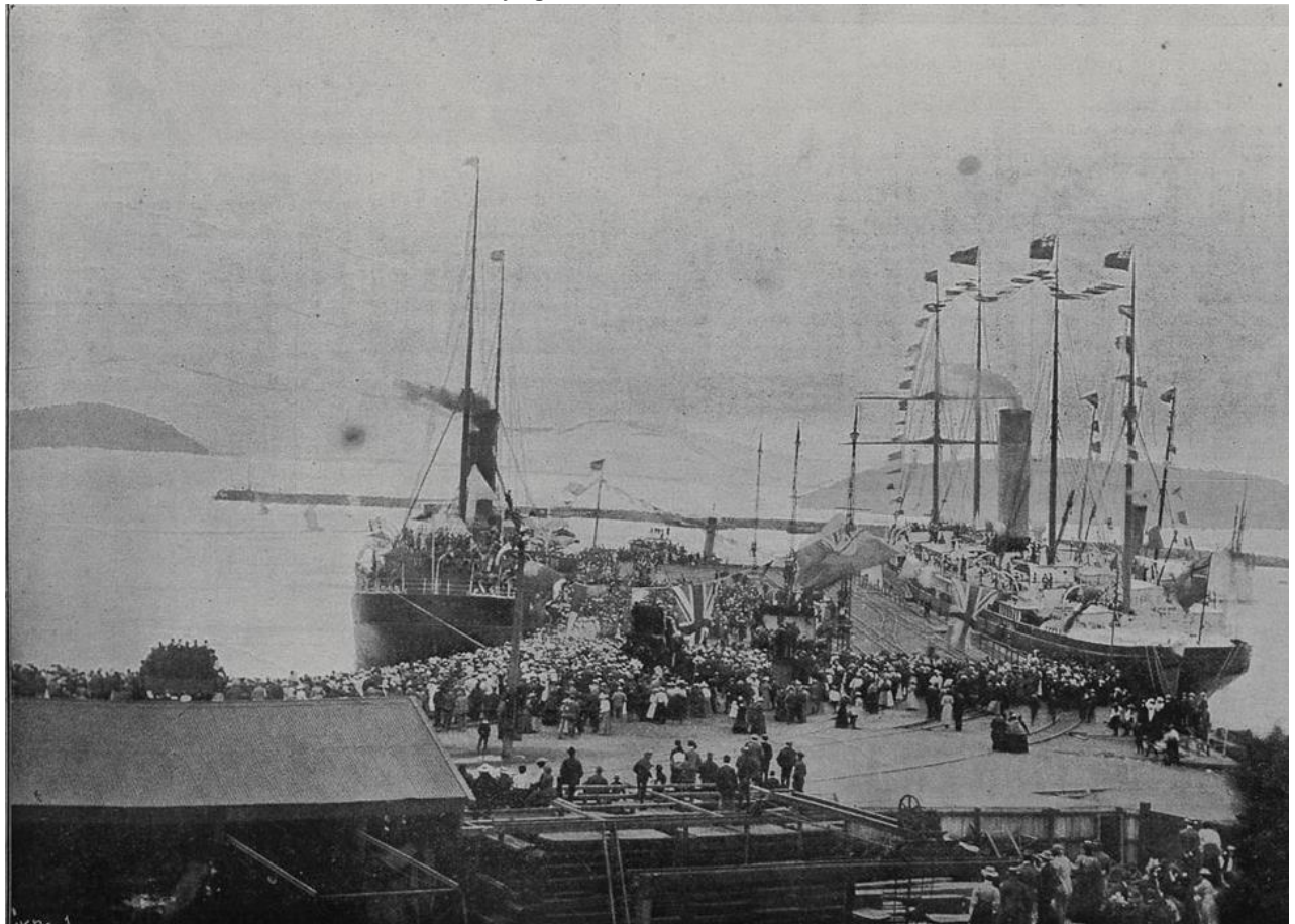
27 Feb 1900 - Scene at the departure of the 'Knight Templae' from Lyttleton with 3rd NZ Contingent