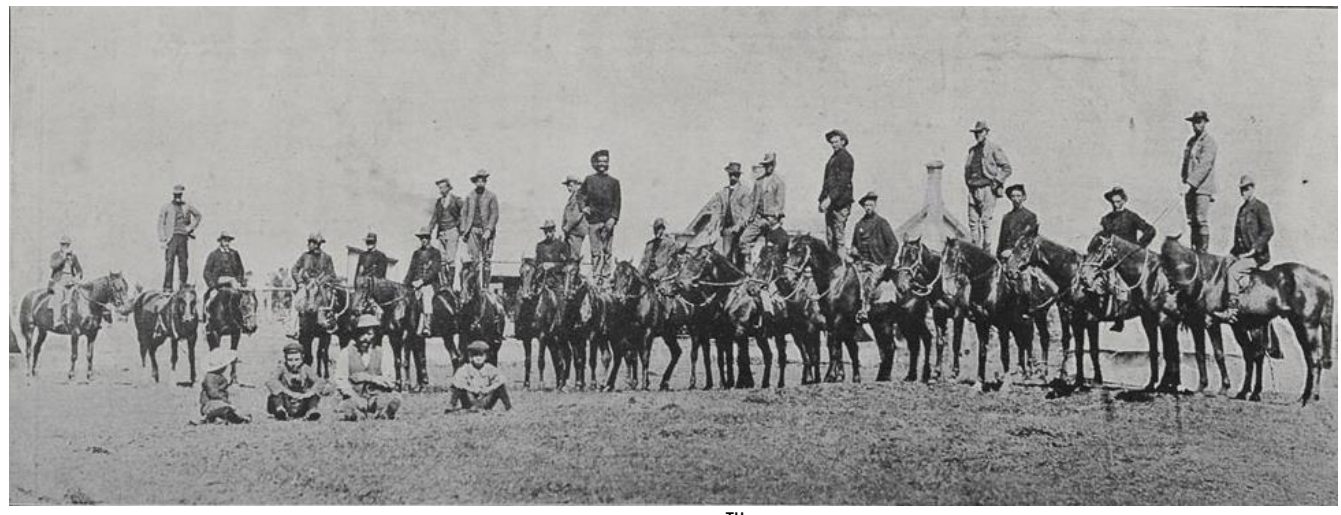
23 Mar 1900 - THE GISBORNE 4<sup>TH</sup> CONTINGENT: A SEVERE RIDING TEST HAD TO BE PASSED BEFORE VOLUNTEERS WERE ACCEPTED FOR THE 2<sup>ND</sup> S.A. BOER WAR